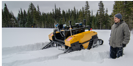
Fig. 2 A 500 kg robot navigating in a subarctic region. Specialized tracks allow the robot to navigate over deep and soft snow.

at around 4^{\circ}\text{C} . A key application affected by this phenomenon is good transportation in northern regions. This kind of transport relies on ice roads, which are mostly crossing frozen lakes and rivers. Advancement in autonomous transportation has the potential of reducing transportation risks, but robots must be conceived with an understanding of ice formation. Sea ice follows the same process, but the crust will tend to break under external forces, such as tides and winds. This sea ice must not be misclassified with icebergs, which also float on oceans, but were generally