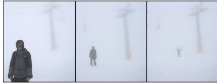
Fig. 4 Example of a perceptual challenge during a whiteout caused by fog and light snow on a mountain. The lack of distinction between the ground and the sky combined with diffused lights pushes to the limit algorithms aiming at scene interpretation or localization.

direct impact on autonomous navigation safety. Any long-term tasks will have to plan for precipitation sporadically limiting the perception of a robot in the cryosphere.